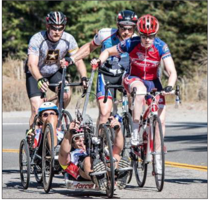
Project Hero has served as a unique opportunity for Veterans to spend time together in a way that is safe and promotes physical and mental well-being. VA Sierra Nevada's partnership with the City of Reno has helped to coordinate programs like this one and others.

Upon acceptance into the 6-month Project HERO program, Veterans will receive a new bicycle with all maintenance included,