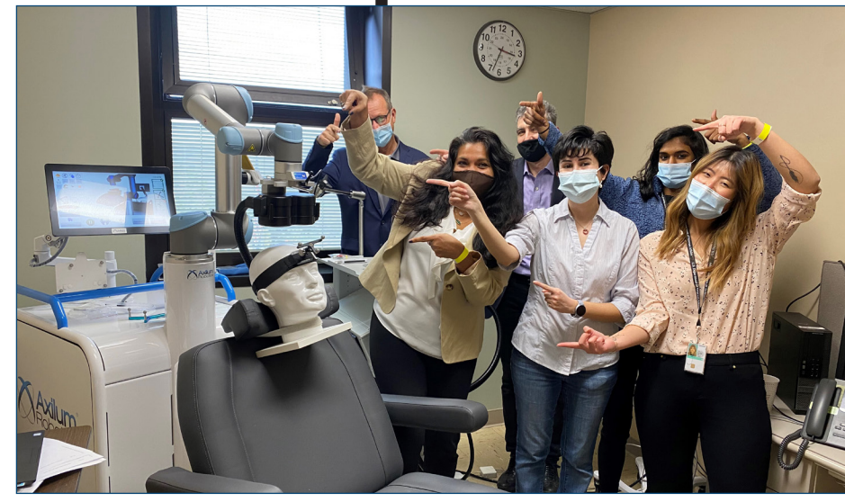
The new and innovative robotic arm with a Transcranial Magnetic Stimulation (TMS) machine is used for research and clinical care for Veterans with various health problems.

The HCOE interdisciplinary team is currently supported by VA, the Department of Defense, and the National Institutes of Health in research clinical trials.