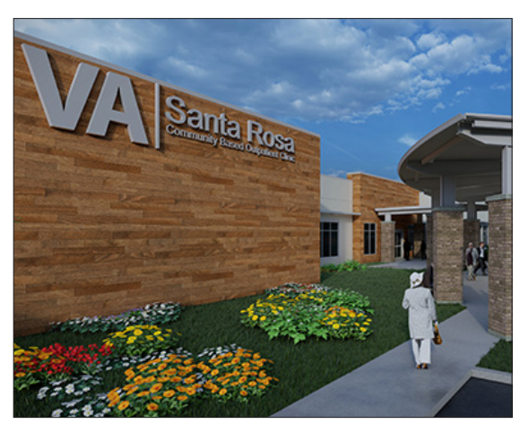
A rendering of the Santa Rosa VA clinic, which is scheduled to open in the summer of 2022.

Construction cost for the 58,000-square-foot clinic is an estimated $12 million.